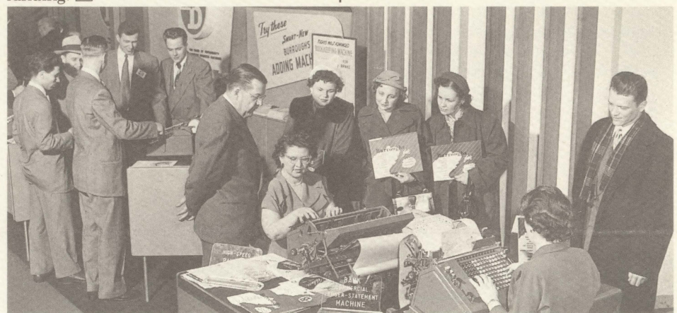
Burroughs exhibit at the 1951 National Office Machine Association meeting in Chicago.