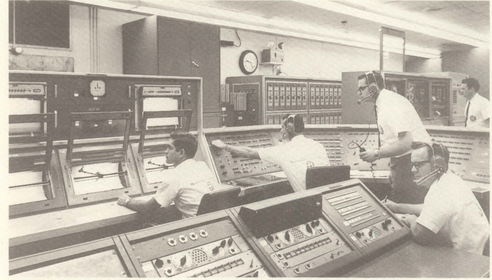
Burroughs' ground-based electronic guidance system, used by NASA to guide ATLAS and Titan missiles, ca. 1960.

Patent Records include some collections on patent research and reports by the patent department. Collections included in this subseries: Patent & TM Reports; Patent R & D Requests; Patent—Misc. (unprocessed).