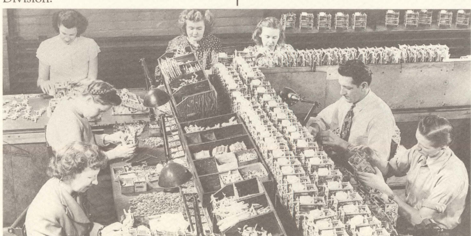
Parts production line at Burroughs manufacturing facility, 1950.