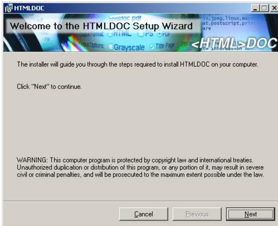
Figure 1-1: The Microsoft software installation wizard